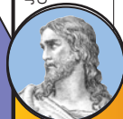
Nephi the disciple